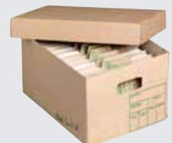
Archive backing boards into off-site storage