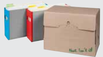
2 x A4 container contents into jumbo archive box