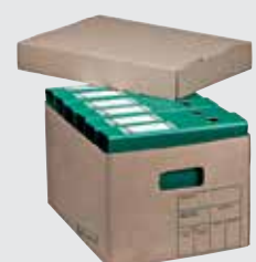
Lever arch files into off-site storage