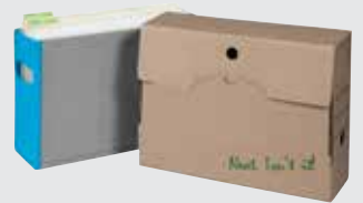
A4 container contents into archive box