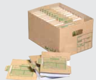
Archive backing boards into off-site storage