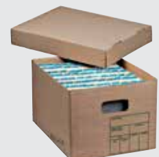
A4 containers into off-site storage