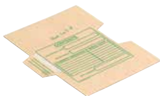
Lateral archive backing board with clip